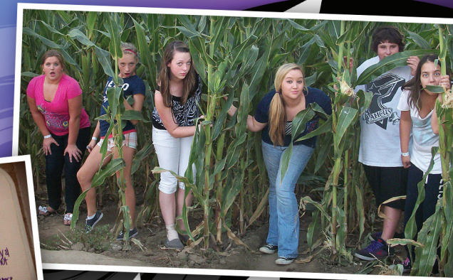
Sonora California, fieldtrip with Class of 2012